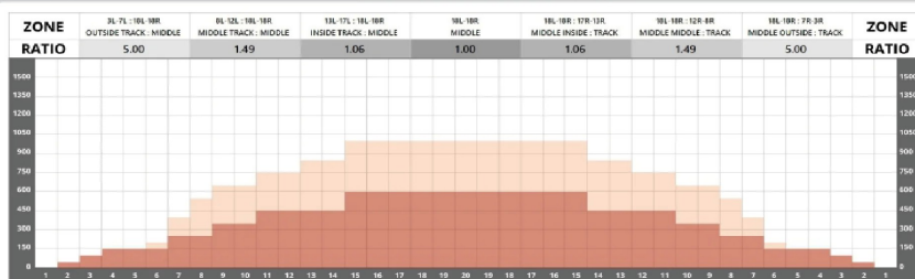
FORWARD LOADS DATA